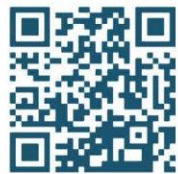
Link to SignUpGenius